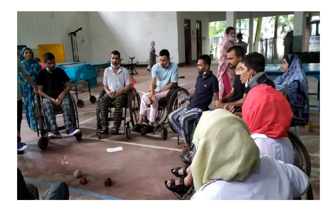
Fig 02: Boccia sports