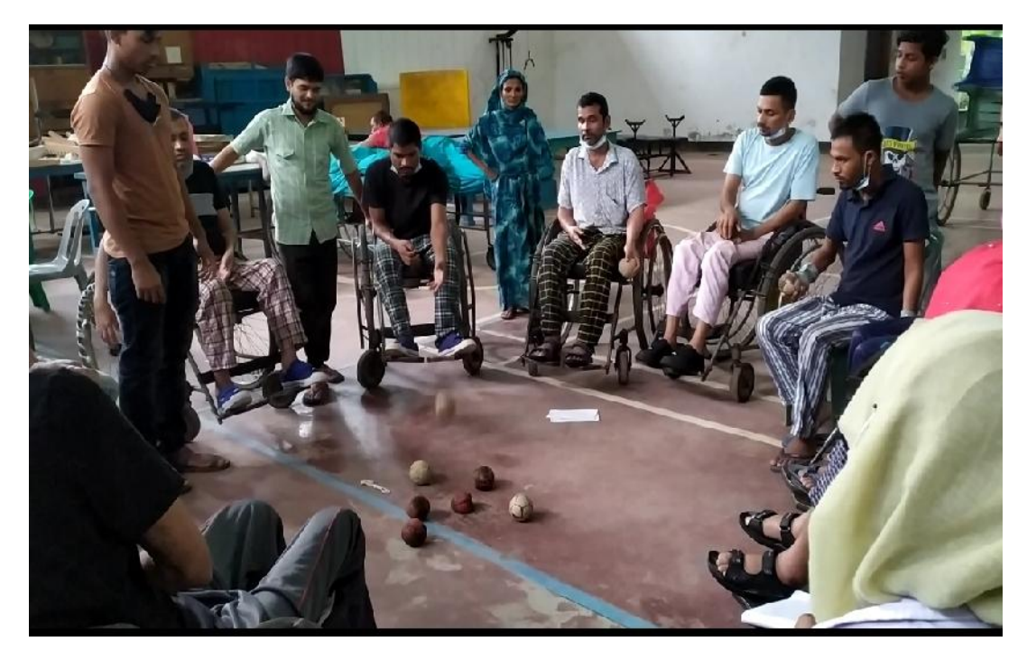
Fig 01: Boccia sports