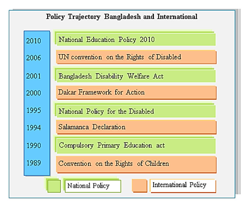
Figure 2: IE policy initiatives of Bangladesh

To practice IE in accordance with the policy initiatives, Bangladesh government has been running two influential programs named as Primary Education Development Programs (PEDPs) and Teaching Quality Improvement in Secondary Education Program (TQI-SEP). In the government document, PEDP and TQI-SEP have been recognized as the means through which inclusive education is to be experienced in classrooms. The first one has been running for more than a decade and second one for 8 years. (Malak et al. 2013)